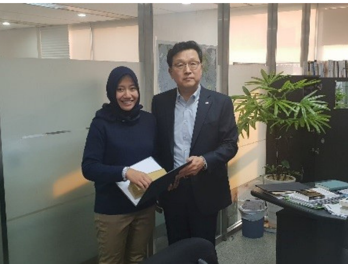
<Hanmi global Internship>