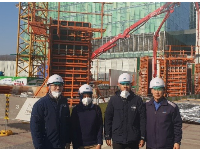
<Hanmi global (site visit) Internship>

As the ISUS new launch program, the Master's Program for Infrastructure Planning and Development (MIPD) enhances its position as the research center for international cooperation in the area of urban science it has facilitated its 2019 winter internship program. This opportunity has been given to eighteen (18) students in achieving their internship session by effectively applying the classroom knowledge to the internship setting held last January 7 to 18, in the following twelve (12) prestigious organizations: