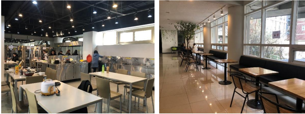
<Community Kitchen & Cafeteria>

electric voltage in Korea is 220V (60hz), and the standards wall socket has two rounded holes. Due to fire hazard reasons, any cooking device that results in fire is strictly prohibited in the room. The dormitory has a community kitchen for students to cook their own food occasionally. Many international students use this community kitchen to cook their own ethnic food and share it with other international or Korean students.