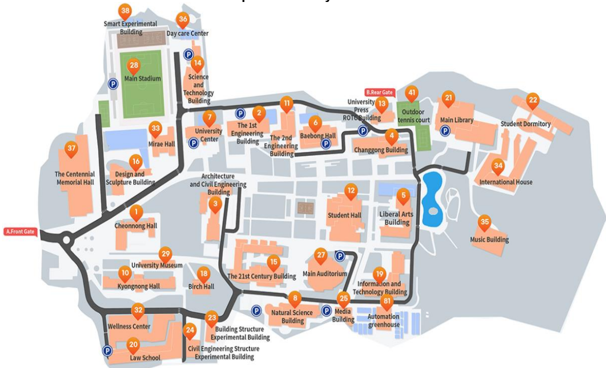
Map of University of Seoul

Bookstore and stationary is in B1, student hall. The opening hour is 09:00 to 19:00(Mon-Fri).