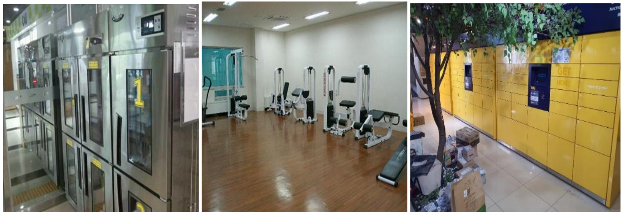
<Laundry Room & Gym & Parcel Delivery Locker>