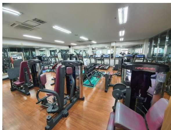
〈Laundry Room and Gym〉