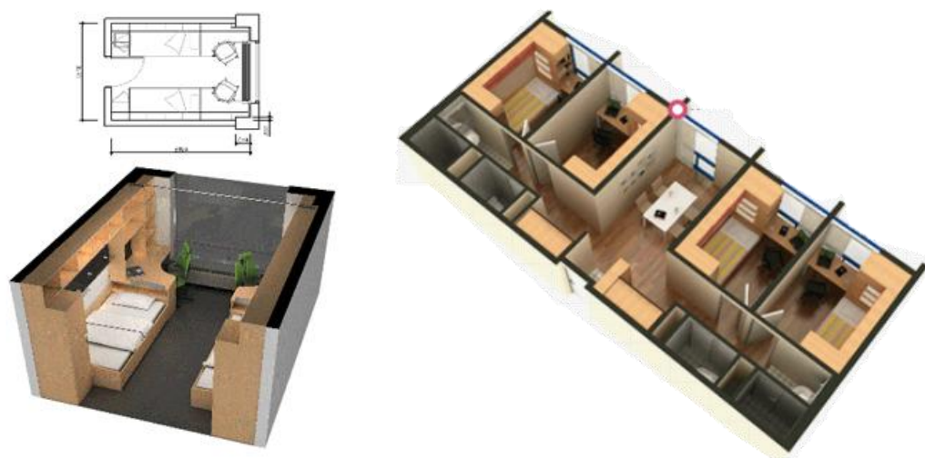
〈Rooms in the Dormitory and International House〉

Room types vary between single and double rooms, and room assignment is centrally administered by the UOS Dormitory Office. The toilet and bathroom are to be shared with 3~5 flatmates.