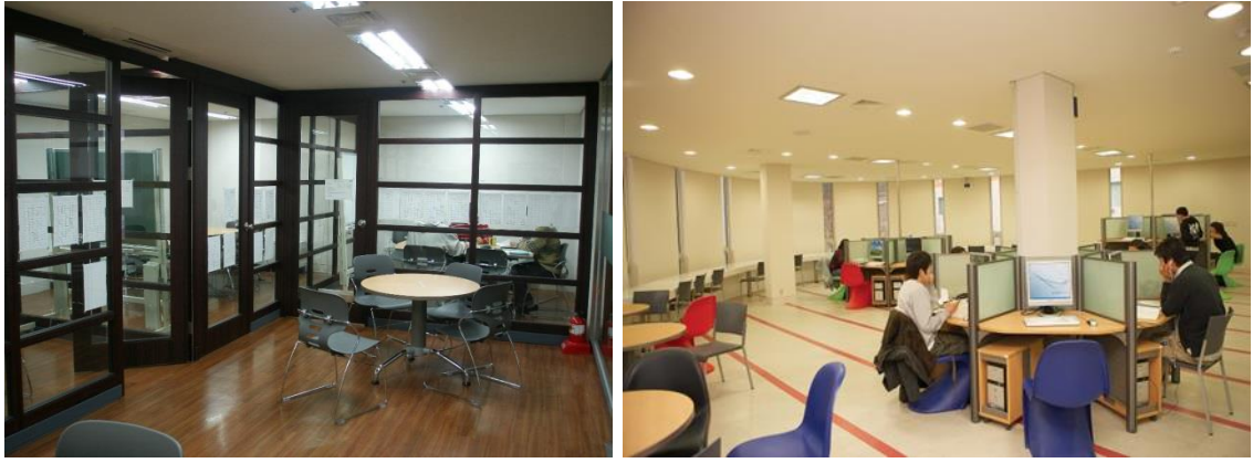
<Seminar Room and Internet Café>