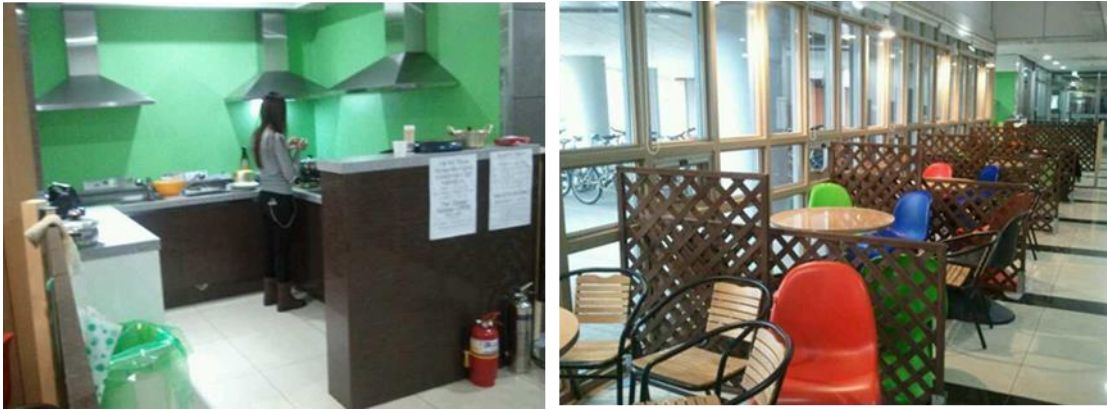
<Community Kitchen & Cafeteria>

The Dormitory and International House provides coin operated laundry rooms and a gym for its residents' use. These are located on the basement floor and open 24 hours. Seminar rooms, student lounges, and an internet café are also available for the residents.