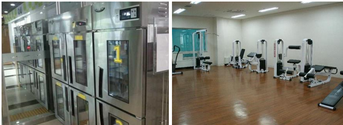
<Laundry Room and Gym>

The Dormitory and International House provides coin operated laundry rooms and a gym for its residents' use. These are located on the basement floor and open 24 hours. Seminar rooms, student lounges, and an internet café are also available for the residents.